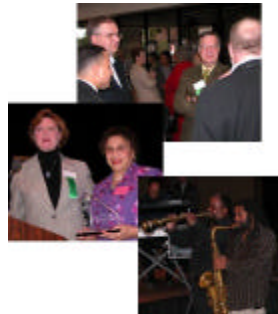
The SOS Celebration of Aging