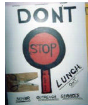
Senior Outreach Services elders created their own signs during SOS art therapy sessions and took them to Columbus